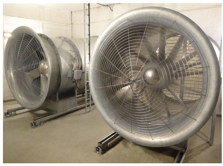
New high efficiency ZerAx® axial flow fans installed at Sima Power Station