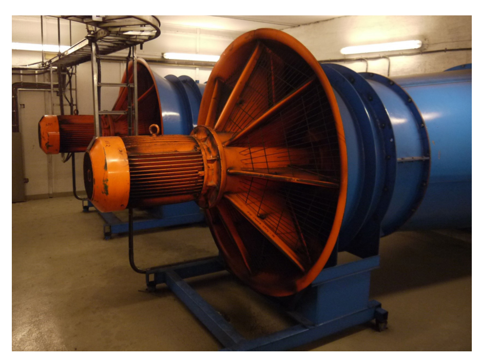
Old NOVENCO fans installed in 1980s

The inlet cones and diffusers were delivered separately and in parts due to the limited space in the tunnels of the power station.